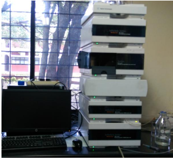
Agilent 1260 HPLC system