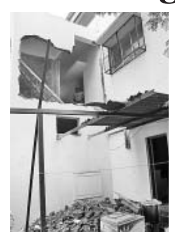
A file photo of the illegal construction.

deserves to be dismissed," he said. However, the court has permitted the petitioner to make a representation to the municipal commissioner with a view to save the structure. The latter would take a decision in accordance