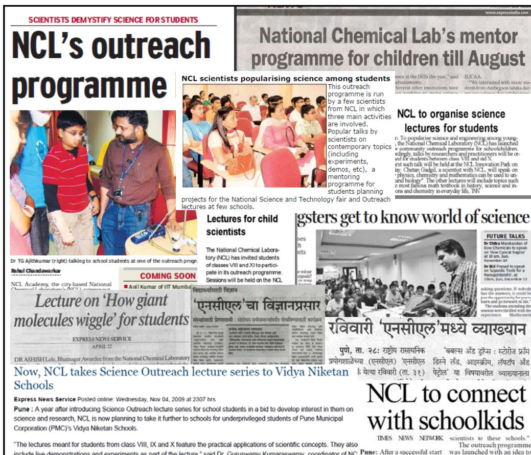
Collage of selected press reports in ToI, Indian Express, DNA, Sakal, and Dainik Jagran.