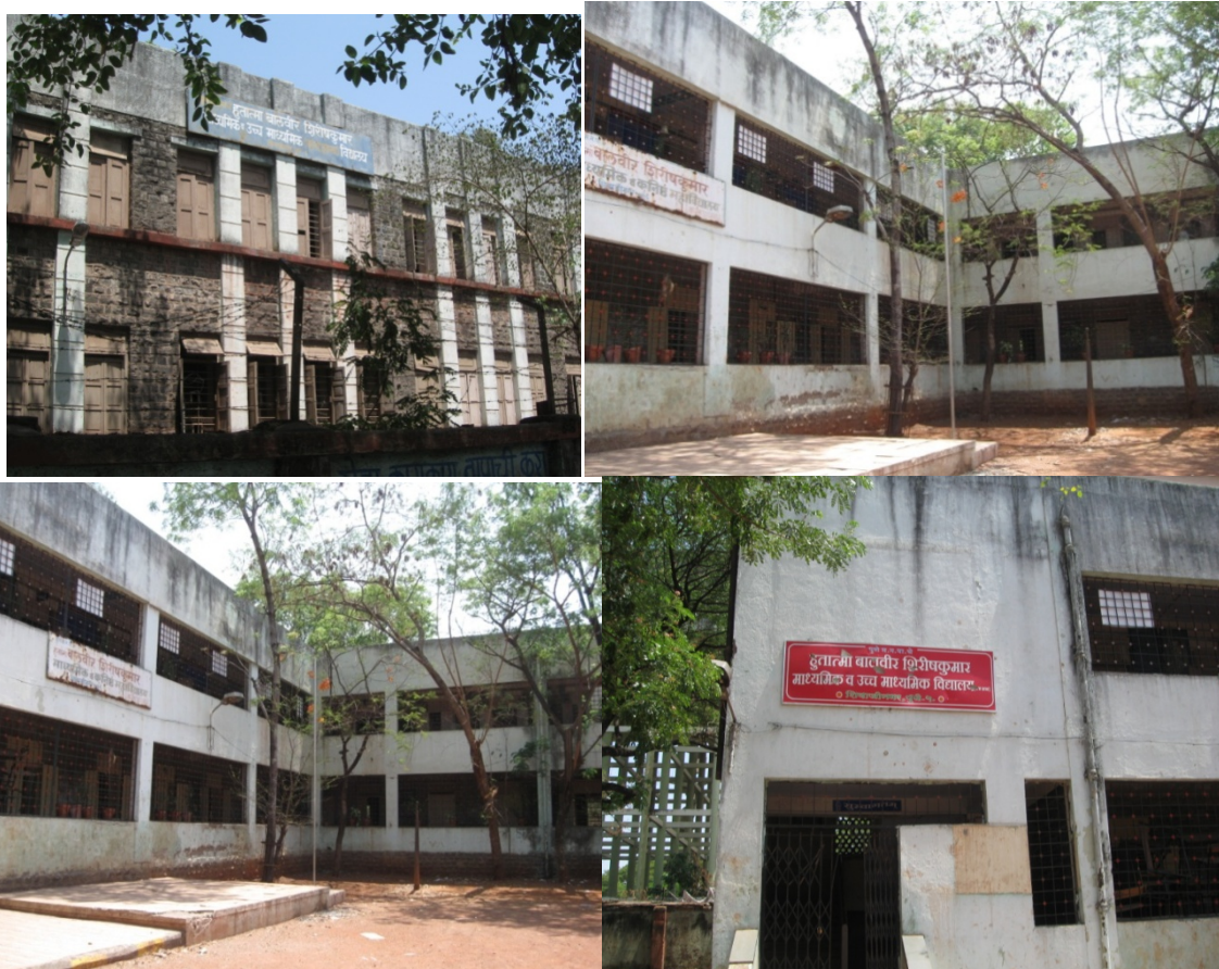
Hutatma Balveer ShirishKumar Vidyalaya, Shivaginagar Pune