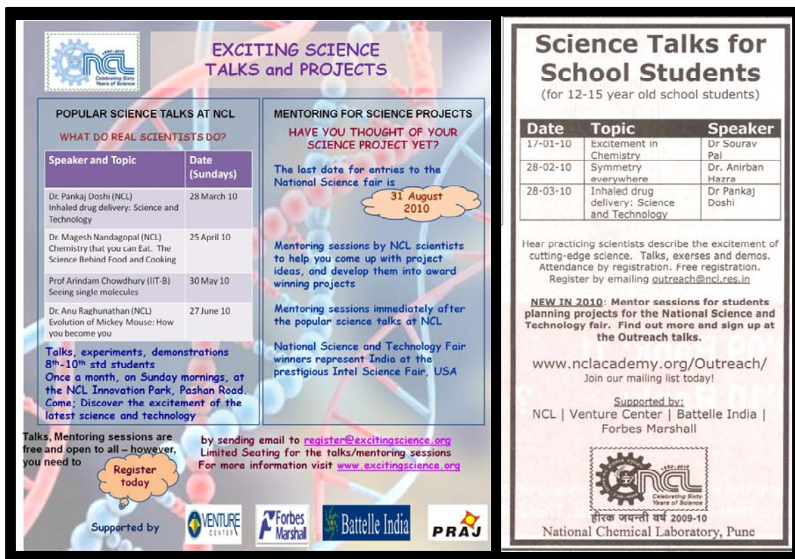
Poster (put up in around 50 schools) and the advertisement that appeared in ToI, IE and Sakal, in January 2010.